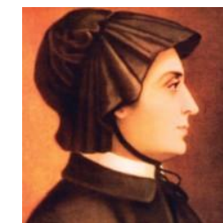
SAINT ELIZABETH ANN SETON: (1774 –1821)

DAILY MASS NOTICE: During the week of January 12 th , daily Mass will not be held from Tuesday, January 14 th , through Thursday, January 16 th (no Adoration either) , due to the 2020 Priests' Convocation. Mass will be held on Friday, January 17 th , at 9am as normal.