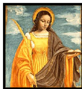
St. AGATHA (235-251)

Worldwide Marriage Encounter (WWME) July 20-22 in Fort Mill & Aug 3-5 in Chapel Hill, NC. Early sign up recommended. For more info. contact us at 803.810.9602 or visit our website at: https://SCMarriageMatters.org applications@scmarriagematters.org