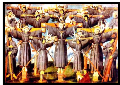
St. Paul Miki (1565-1597)

Jesus said " if a grain of wheat falls to the ground & dies, it produces much fruit "